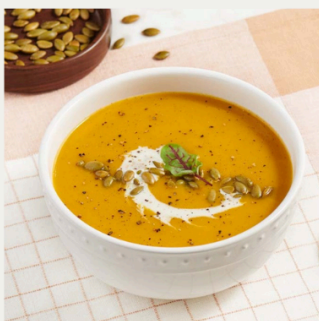
Harvest Butternut Squash 4/4# | 00769