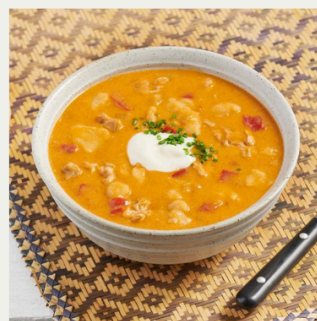
Chicken Hungarian Paprikash 4/4# | 07675