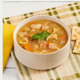
Homestyle Chicken Noodle 4/4# | 00715