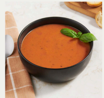
Tomato Basil Bisque 4/4# | 00736