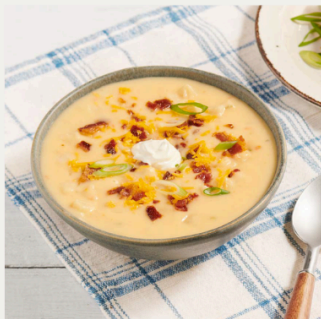
Ultimate Loaded Potato 4/4# | 00362S