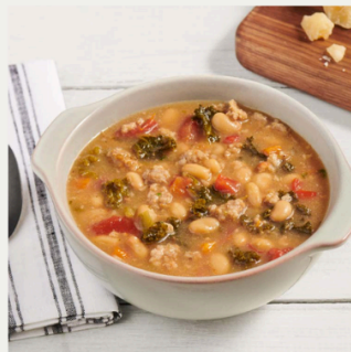
Tuscan Sausage & Kale 4/4# | 00397