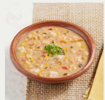
Shrimp & Corn Chowder 4/4# | 07682