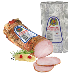
Roasted Pork Loin