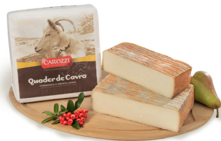
Taleggio Goat Milk Quader de Cavra

Unique goat's milk Taleggio, bright, tangy, and aromatic.