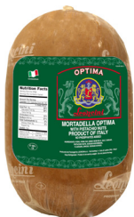
Mortadella Pistachio Imported 8 LB

Silky texture, buttery flavor, studded with pistachios.