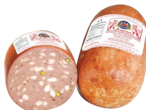
Mortadella Chili Pepper & Pistachio

Silky mortadella balanced with spicy chili heat and crunchy pistachio.