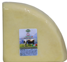
Asiago Fresco (Fresh) 1/4's

Mild, creamy Asiago, soft, approachable flavor, wonderfully fresh.