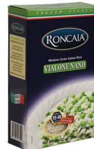
Rice, Vialone Nano Bulk

Plump grains, creamy texture, and delicate nutty flavor.