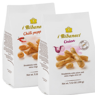
Breadstick, Chunky Chili Breadstick, Chunky Onion

TS 00009B - 24/3.5 OZ 00085B - 24/3.5 OZ