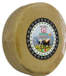
Asiago Vecchio DOP

Long-aged Asiago, firm, nutty, sharp complexity, deeply satisfying.