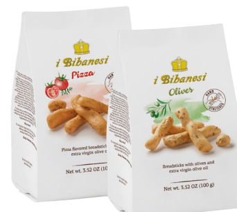
Breadstick, Chunky Pizza Breadstick, Chunky Olives