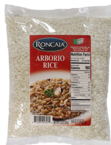
Rice, Arborio Bulk