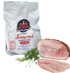
Ham Oven Roasted with Rosemary

Fragrant herbs, savory depth, perfectly balanced roast.