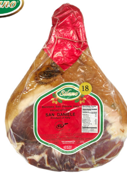
San Daniele Prosciutto Boneless - 18 mo

Long-aged, elegant sweetness with silky texture.