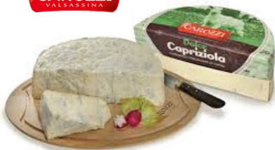
Blue Capra Wheel, Goat Capriziola

Bold goat flavor, creamy blue, tangy complexity.