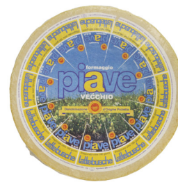
Piave 6 Mos Vecchio DOP

Young Piave, firm, sweet, mild nuttiness, balanced profile.