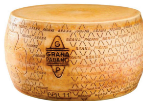
Grana Padano Full Wheel

Classic Italian grana, rich, savory, crystalline bite.