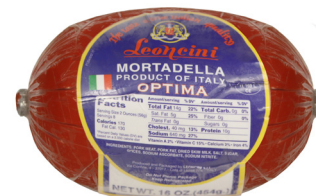
Mortadella Plain Imported

Smooth mortadella with delicate seasoning and a mild, savory flavor.