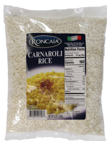
Rice, Carnaroli Bulk