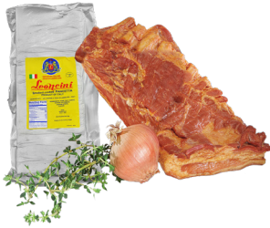
Pancetta Smoked, Flat

Robust smoke, layered flavor, perfect for cooking or charcuterie.