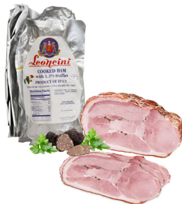
Ham Cooked with Truffles 1/2 Cut

Delicately seasoned ham infused with earthy truffles, offering rich flavor.