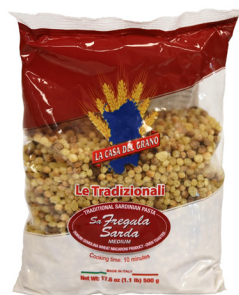
Fregola Sarda Medium

Toasted Sardinian pasta pearls with nutty flavor, hearty texture, and rustic authenticity.