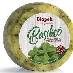
Primosale Pesto Genovese - 1 KG

Bright and fresh sheep's milk cheese, semi-firm with aromatic pesto.