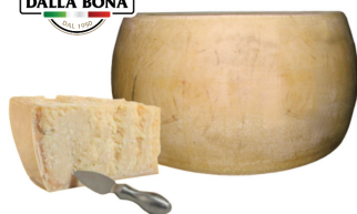
Gran Duca Wheel Plain

Versatile grating cheese, balanced, savory flavor.