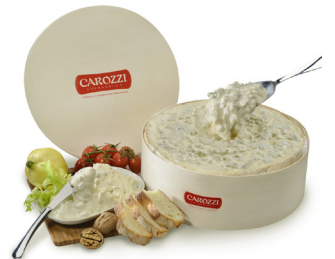
Gorgonzola, Cucchiaio (Cremiziola)

Spoonable, ultra-creamy blue with rich savory notes.