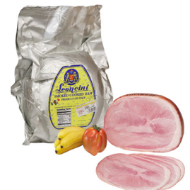
Ham Smoked Cooked

Subtle smokiness, delicate texture, versatile for menus.