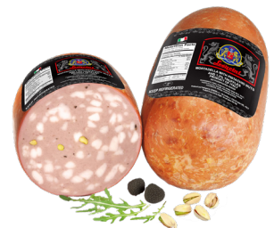
Mortadella Truffle & Pistachio

Luxurious truffle essence with savory nutty finish.