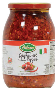
Spread, Crushed Hot Chili Peppers