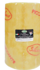
Provolone Imprtd Aged 1 Year (PC)

Sharp, aged provolone with bold flavor, strong finish.