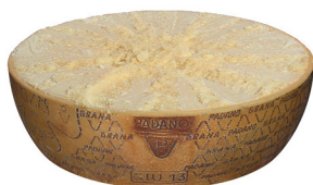
Grana Padano 1/2 Wheel

Smooth, nutty profile, long-aged tradition.