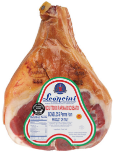
Prosciutto di Parma - 16 mo

Aged perfection, sweet-savory balance, and velvety texture.