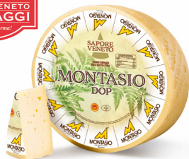
Montasio 2 Year Stravecchio DOP

Hard, crystalline texture, nutty aged intensity, deeply flavorful.