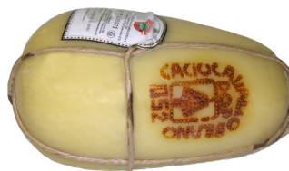
Caciocavallo Silano DOP - Calabrese

Traditional stretched curd, tangy, savory Calabrian cheese, unmistakably authentic.