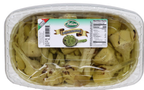
Artichokes, Grilled with Stems

Smoky, tender hearts with savory flavor, perfect antipasto or garnish.