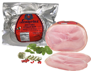
Ham Cooked - Red Label 1/2 Cut

Tender, delicately seasoned Italian ham with authentic flavor.