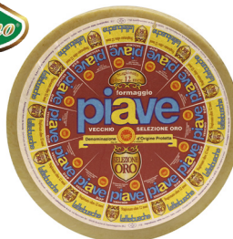
Piave 12 Mos Oro DOP

Extra-aged Piave, crystalline texture, sweet finish, complex nuttiness.