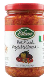
Spread, Hot Mixed Vegetable

Zesty medley of vegetables, tangy heat, balanced bite for crostini.