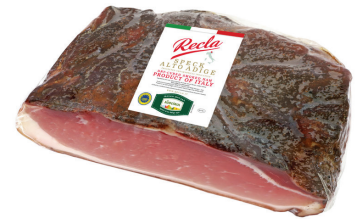
Speck - 5.5 LB Smoked Prosciutto

Smoky, aromatic, alpine tradition with refined flavor.