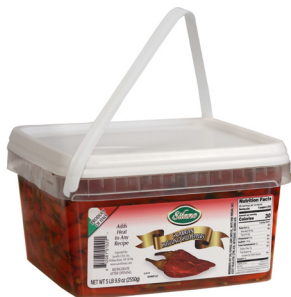
Peppers, Calabrian Hot Long Chili