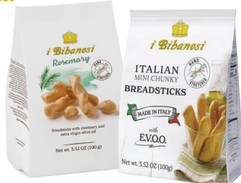
Breadstick, Chunky EVOO Breadstick, Chunky Rosemary