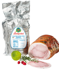
Porchetta Oven Roasted

Juicy, seasoned ham with aromatic herbs.