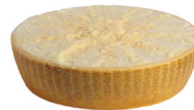
Parmigiano Reggiano 1/2 Wheel

King of cheeses, complex, aged, umami depth.