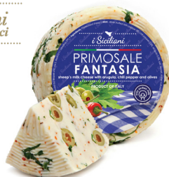
Primosale Fantasia - 1 KG

Made from whole sheep's milk, with olives, arugula, and peppers for a zesty flavor.