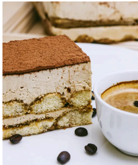
Traditional Tiramisu Creamy Mascarpone Layered On Espresso-Soaked Ladyfingers. RCS101 - 15/2.9 OZ