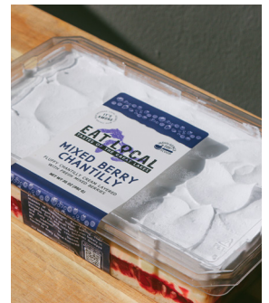
Mixed Berry Chantilly Scoop Cake

Fluffy Chantilly Cream Layered with Fresh, Mixed Berries.