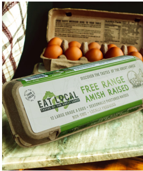
Large Grade A Farm Raised Eggs 114 - 1/15 DOZ