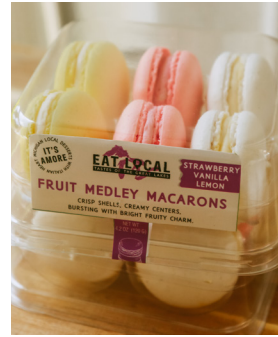
Fruit Medley Macarons Strawberry - Vanilla - Lemon

Crisp Shells, Creamy Centers, Bursting With Bright Fruity Charm.