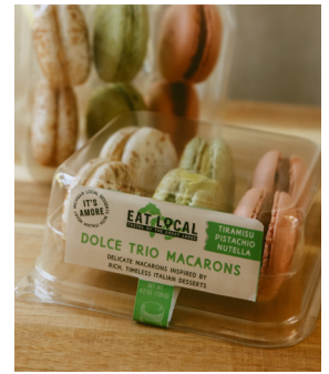
Dolce Trio Macarons Tiramisu - Pistachio - Nutella

Delicate Macarons Inspired By Rich, Timeless Italian Desserts.