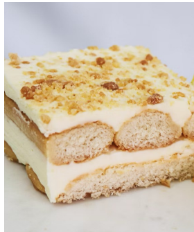
Lemon Mascarpone Tiramisu Lemon-Infused Mascarpone Layered With Delicate Ladyfingers. RCS102 - 15/2.9 OZ