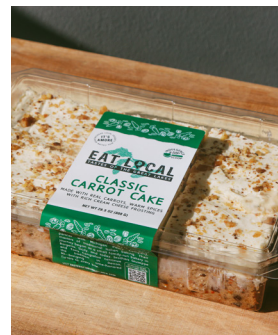
Classic Carrot Cake Scoop Cake

Made With Real Carrots, Warm Spices And Rich Cream Cheese Frosting.