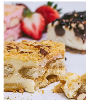
Italian Almond Tiramisu Layers Of Creamy Almond Topped With Crumbles And Sliced Almonds. RCS104 - 15/3.8 OZ