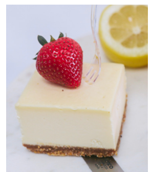
New York Cheesecake Classic, Creamy New York Cheesecake With A Nutty Graham Crust. RCS110 - 15/4 OZ