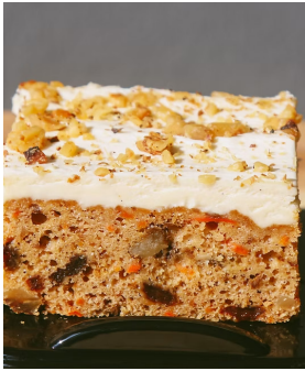
Classic Carrot Cake

Made With Real Carrots, Warm Spices And Rich Cream Cheese Frosting.