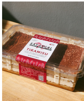
Tiramisu Scoop Cake

Creamy Mascarpone Layered On Espresso-Soaked Ladyfingers.