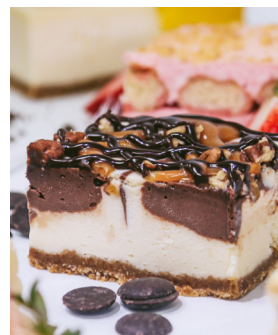
Turtle Cheesecake Creamy Marbled Cheesecake Topped With Caramel, Chocolate And Pecans. RCS109 - 15/4.6 OZ