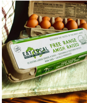
Extra Large Grade A Farm Raised Eggs 111 - 1/15 DOZ