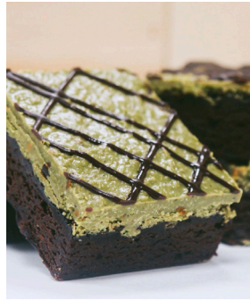
Dubai Dream Brownie

Silky Milk Chocolate Brownie And A Creamy Blend Of Pistachio With Golden Kadaif, Drizzled With Chocolate.