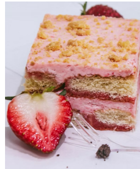
Strawberry Crunch Tiramisu Sweet, Creamy Layers Of Strawberry Mascarpone Topped With A Crunchy Delight. RCS103 - 15/3.2 OZ