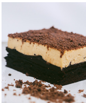
Mocha Fudge Brownie Rich Mocha Layered Over A Fudgy Brownie Topped With Chocolate Crumbles. RCS106 - 15/3.3 OZ