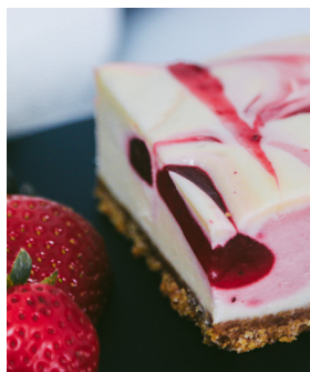
Strawberry Cheesecake Swirl Creamy Cheesecake Swirled With Sweet Strawberry Syrup. RCS108 - 15/4 OZ