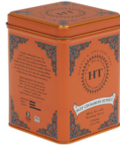
HOT CINNAMON SUNSET