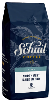
NORTHWEST DARK BLEND