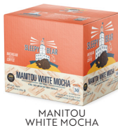
MANITOU WHITE MOCHA