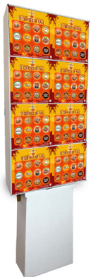
SLEEPY BEAR SHIPPER