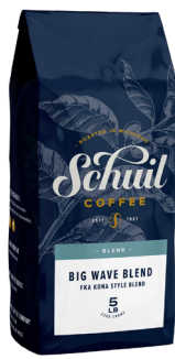
BIG WAVE BLEND