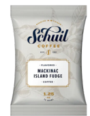
MAKINAC ISLAND FUDGE