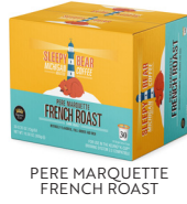
PERE MARQUETTE FRENCH ROAST