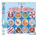
12 COFFEES OF CHRISTMAS